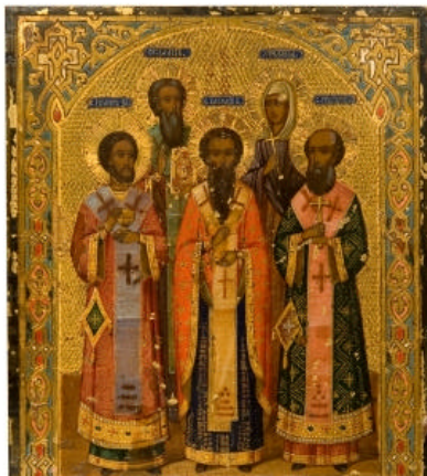
Ancient icon of 18 century, the author is unknown.